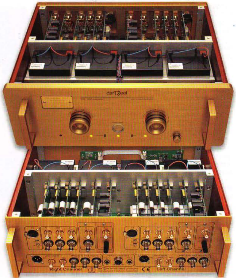
ABOVE: While keeping the signal path simple, the optical control system makes the NHB-18S a very complex product

'The problem is that when the circuit is very simple, you are very close to being unstable. The goal was a circuit that could be made very stable, whatever the load. Also I wanted to avoid any negative feedback as far as possible, save for the internal small feedback.