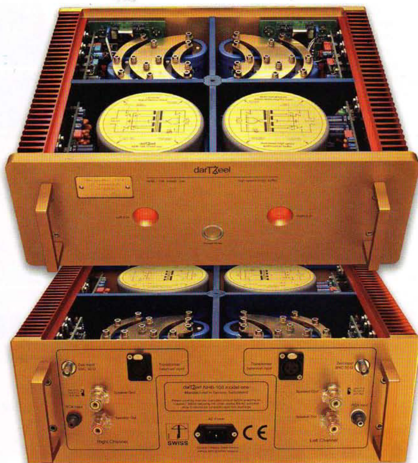
ABOVE: darTZeel's stunning build quality is visible through the power amp's glass top

'So it was not my goal to look for low distortion. In the spec, we just say that our machines are less than