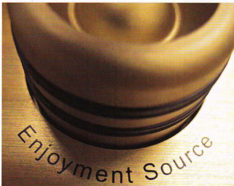
ABOVE: Pure enjoyment? Source selection is achieved with no switching or contacts in the signal path

'Because we did not have time to make all the development work at darTZeel, we started a