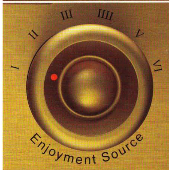
ABOVE: darTZeel believes that products for playing music really should have a 'human' face